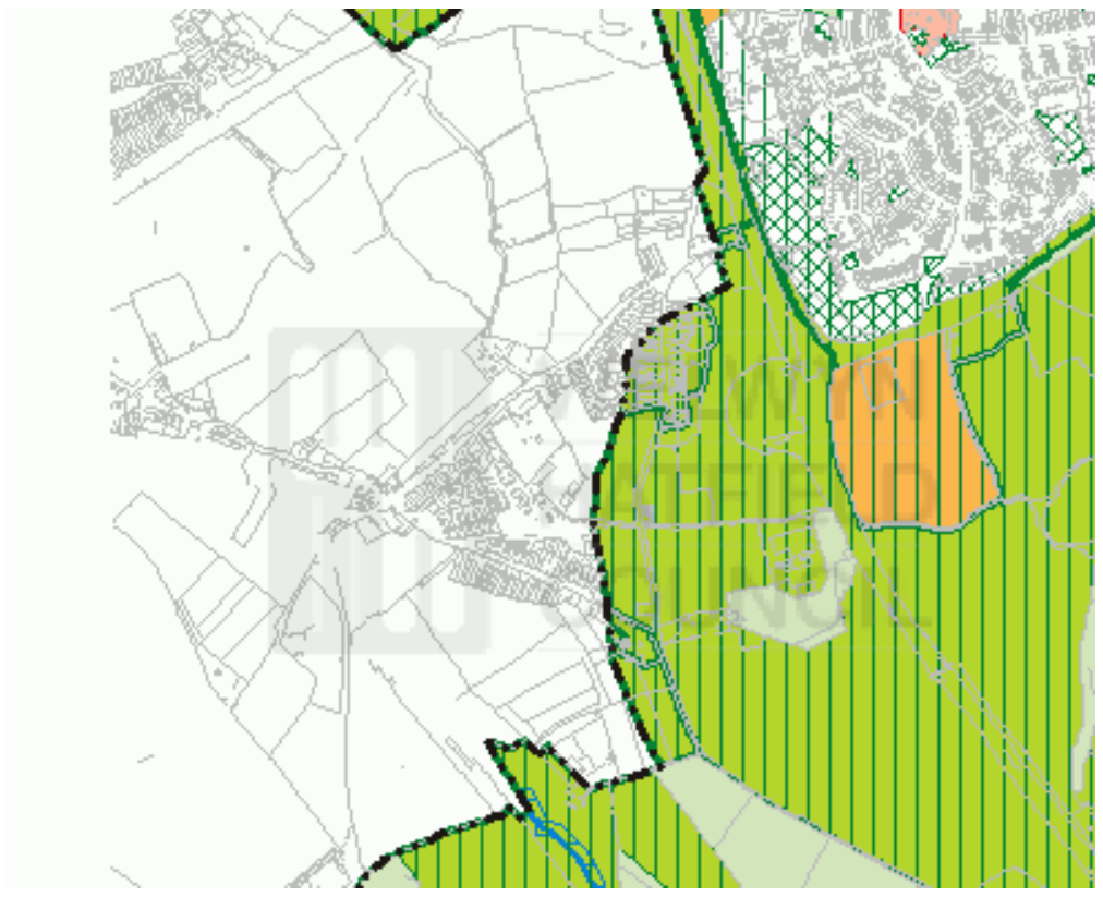
Extract of The Welwyn Hatfield Proposals Map

2.16 Public Footpaths 23 and 48 are part of a wider network of public rights of way that cross this area of countryside linking to St Albans, Hatfield and neighbouring Green Belt settlements. These public rights of way will be described and are shown on the extract plan below: