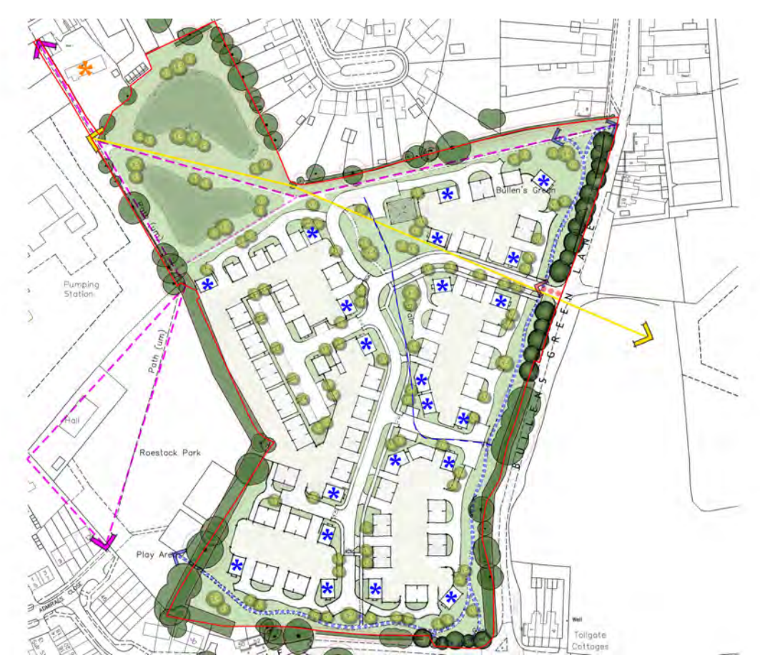
The Illustrative Proposed Site Plan

3.4 The Councils will, consistent with the Officers Reports, describe the proposals and comment on the illustrative layout and the likely impacts of a development of this scale and number of dwellings, and will contrast the proposal with the existing open condition of the appeal site.